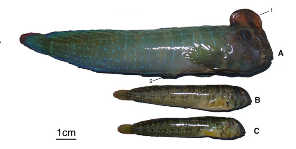
Fig. 1 Photograph of a mature male (a), a female (b) and a parasitic male (c) during the breeding season. 1 Head crest; 2 fully developed anal gland

An integrative approach was used to address these questions: transects to quantify abundance and dispersion of nest sites (Saraiva et al. 2012), behavioural