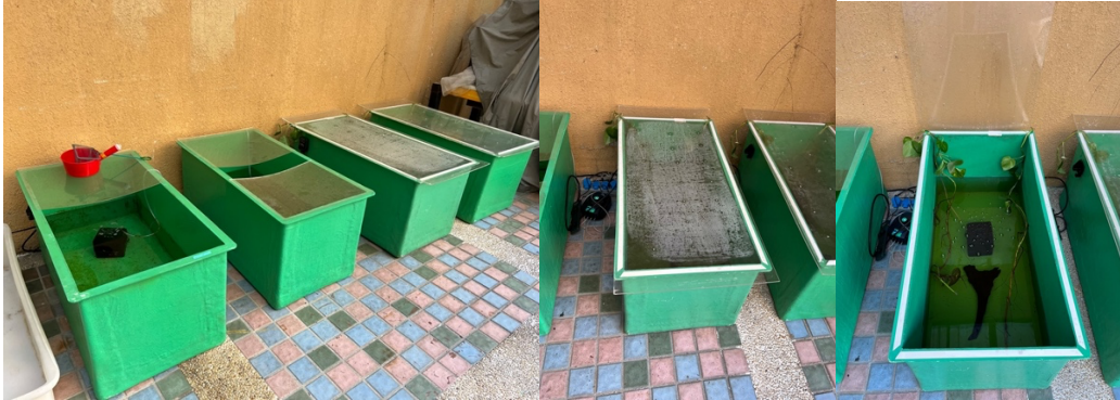
Fig. 2 - Fibreglass outdoor growing tanks.