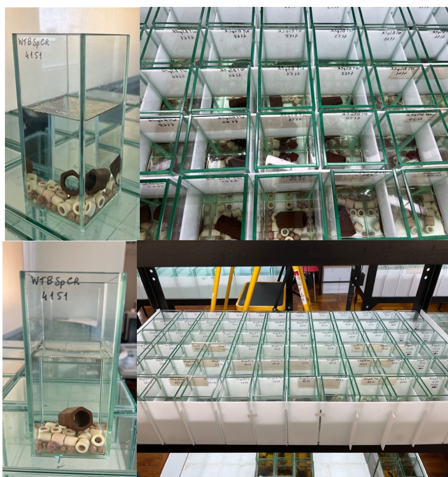
Fig. 1 - Individual tanks.